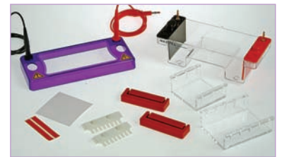
components of multiSUB Mini Duo

Buffer saver blocks physically reduce the volume of a gel chamber and so reduce buffer requirements, saving cost.