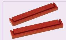
Casting dams allow gels to be rapidly cast externally while the MultiSub™ unit is in use for gel running

Three tray sizes are available – 20 x 20cm, 20 x 25cm and a half-length 20 x 10cm. Multichannel pipette compatible combs up to 40 sample facilitate speed loading of up to 440 samples per gel. 50 sample combs allow maximum sample capacity of 550 samples per gel.